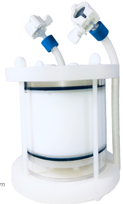
1.5L Column Volume (100mm ID x 200mm BH)